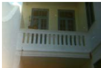
The Ribeiro dos Santos Building - Balcony of the Flat