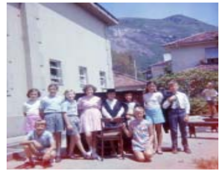
The British School, 'Salad Days'